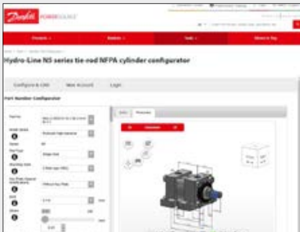
The Online Cylinder Pricing and CAD Configurator